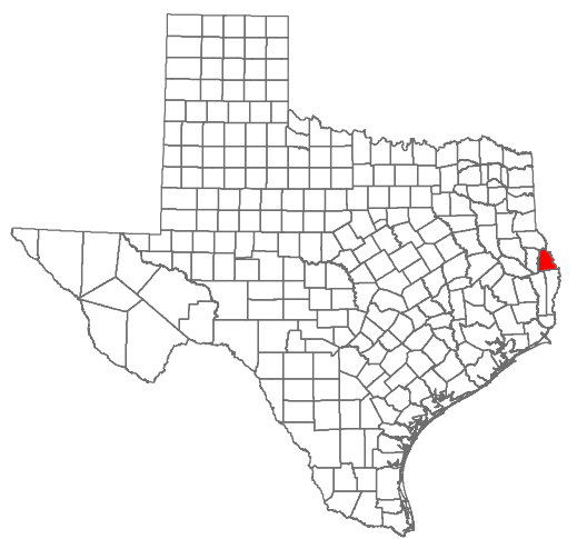
Sabine County, Texas

FINANCED THROUGH THE TEXAS DEPARTMENT OF AGRICULTURE. Preparation of this document was financed through provisions of a Texas Community Development Block Grant from the U.S. Department of Housing and Urban Development. This illustration was created using the best available data. Subsequent additions, edits, & georectification performed by GrantWorks, Inc.