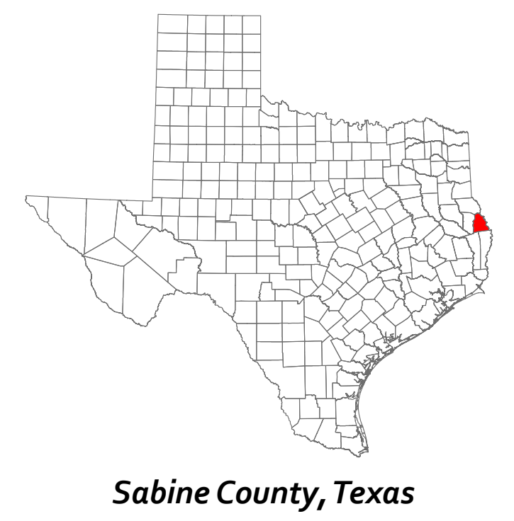
Sabine County, Texas

GrantWorks GrantWorks, Inc. 2201 Northland Drive, Austin, TX 78756 Phone (512) 420-0303 Fax (512) 420-0302